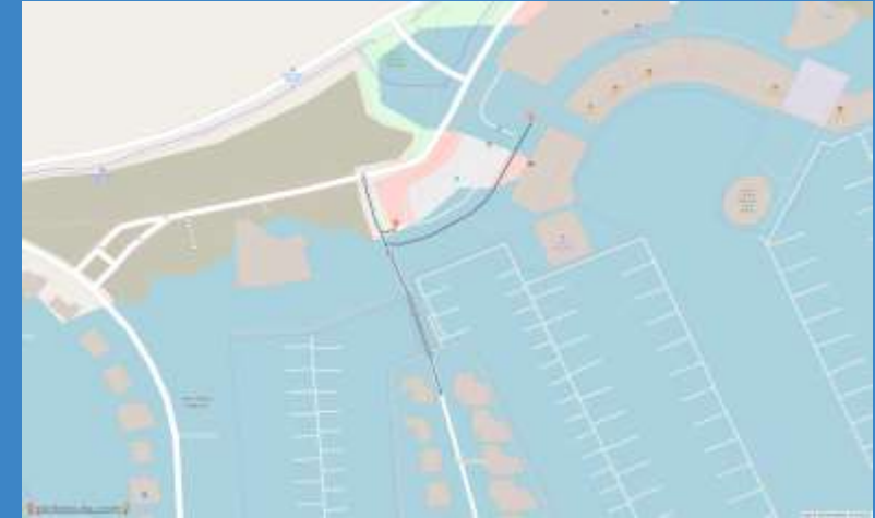
KIDS RUN Leg 2

https://www.plotaroute.com/route/2260900