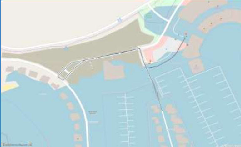
KIDS RUN Leg 1

https://www.plotaroute.com/route/2260902