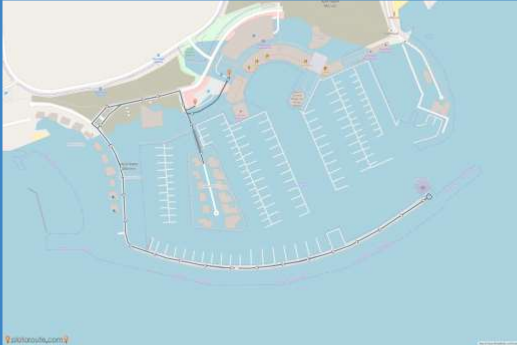
Run leg 1 & 2

https://www.plotaroute.com/route/2211412